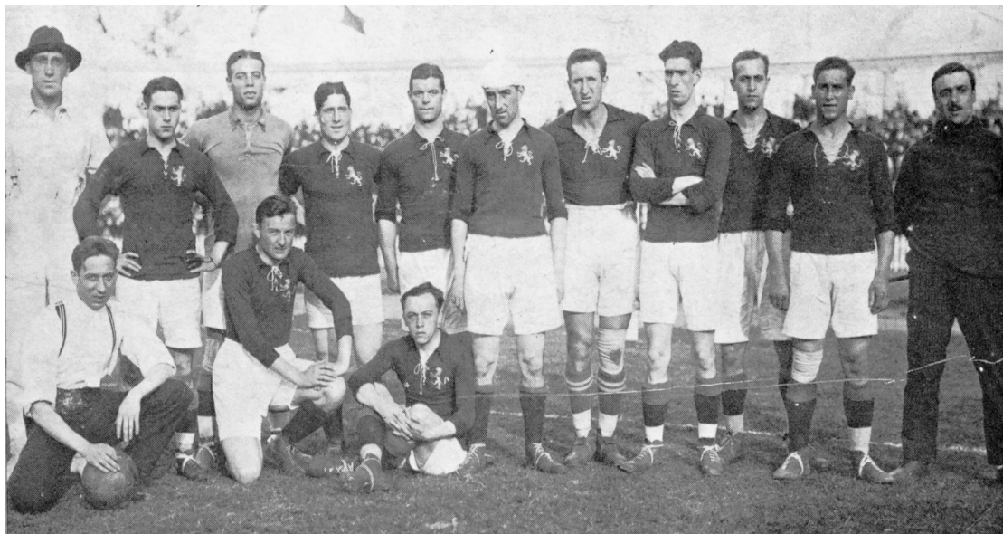
The Spanish Team at the 1920 Olympic Games in Antwerp